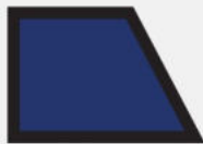
ROYAL BLUE Energetic