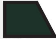
FOREST GREEN Natural