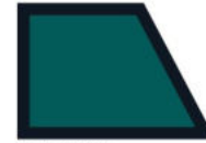
AQUA GREEN Nurturing