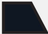
NAVY BLUE Classic