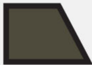
MOUNTAIN GREY Stable