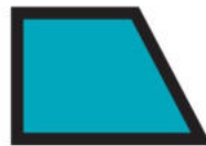
AZURE BLUE Serenity